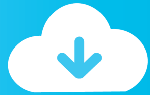
Figure Study Made Easy By Aditya Chari Pdf Download